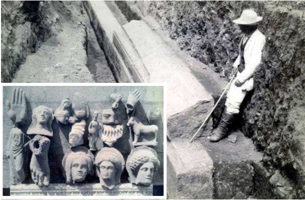
Figure 1: The Site of Nemi and Artefacts Found There.

populated by content which put emphasis on issues around reconstruction, on deriving interpretation from material evidence, on competing interpretive narratives, and on recreating the potential atmosphere of a site such as the Sanctuary of Diana, devoted to worship and sacrifice, health, and the more mundane needs of self-representation (Lorenz, Schofield and Noond 2006, Lorenz 2007, Lorenz and Bligh 2010).