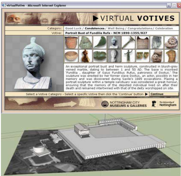
Figure 2: The Nemi Website and Site Reconstruction.

This led to three-dimensional computer models of the temple at Nemi being created to interactively visualise different pathways for interpretation by the online museum user (Figure 2). Typically such models are glossy and hermetically sealed representations of the site. Instead, the model maps the uncertainties of reconstruction and multiple interpretations of the individual features of the site. The model confounds the notion that three-dimensional historical reconstructions are absolute, and facilitates user engagement with the fluidity of historical interaction and its modern interpretation (Lorenz, Schofield and Noond 2006).