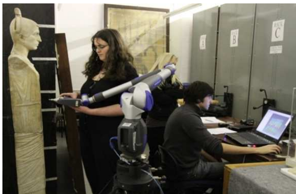
Figure 4: Scanning the Nottingham Fundilia Statue.