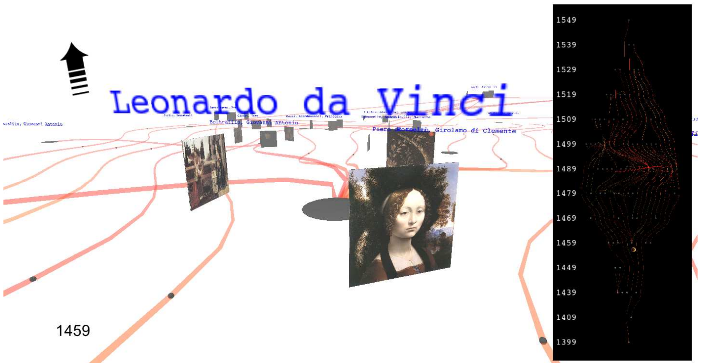
Figure 3: The Information Landscape

This work was funded by the FWF (Fonds zur Förderung der wissenschaftlichen Forschung / Austrian Science Fund), Project No. L602, "The Virtual 3D Social Experience Museum".