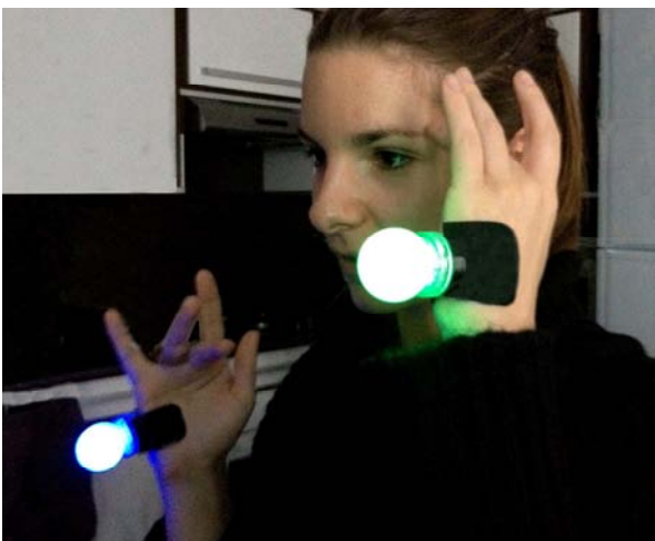
Figure 1: A signer equipped with the markers

The ThirdEye motion capture system was designed to be modular. It can be broken down in three parts: the device itself, the capture part of the code, and the rendering. The device itself can change, as can the rendering, or even just the output. This makes ThirdEye a very versatile tool that can be used with any kind of motion capture system.