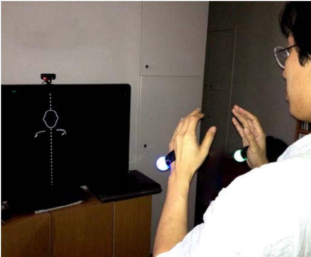
Figure 5: A signer using ThirdEye

We imagined several experiments designed as games (except the first one). Each of them is a communication scenario and they all aim at understanding how our very abstract and simplified rendering of the movement can act as a communication medium and to what extent.