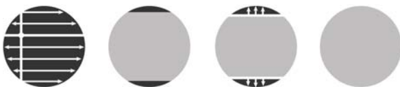
Figure 3: Filling algorithm

To get the z-value, we try to systematically fill the majority of the pixels of the disk. The filling algorithm works by, first scanning the surface from top to bottom, extending lines left and right of the vertical segment we already have, we scan the surface line by line by searching matching pixels left and right. This usually gives a rather good filling of the surface, but we still miss a little part from the top and bottom of the disk. Hence in this subset of "left to right" lines, we take the top one (lowest y-value), and the bottom one (highest y-value) and from each pixels of the upper one, we extend lines up, and do the same downwards for the bottom one until we reach out of the disk. During all that process, we count the total number of pixels. This number is correlated to the surface of the disk, and since this surface is linked to the diameter of the disk, we can deduce from it the size of the spherical marker, and hence the distance between the camera and the marker. One interesting thing to note is that in this process, most of the processing is done on markers' pixels, hence reducing the cost in time of image processing since we never actually go through every pixel in the image.