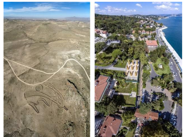
Figure 4 & 5: Andrew Rogers' artwork (left), Heinz Mack's artwork (right).

Though I took photos of these impressive artworks from the ground level, I decided to fly my drone as well since I thought the most appropriate photos of these works could only be produced from the sky. Alternative to many single photos I shot, I also took multiple photos tilting drone's camera vertically in small increments, with the aim of stitching a vertical panorama that would display multiple perspectives ranging from totally downward aerial to not-titled regular camera positions. The final stitched image reduces many gazes into a unique solo gaze that cannot be obtained by naked eye / single photo. Same unique photographic description can also be seen in the subsequent documentary image of German artist Heinz Mack's installation labelled "The Sky Over Nine Columns" at the Sakip Sabanci Museum, Istanbul.