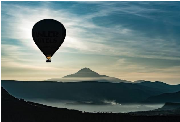
Figure 3: Cappadocia as seen from a hot air balloon

I would like to mention two rather unusual tools some photographers prefer to take aerial photos from relatively closer distances to ground level. The first one is a very tall tripod called megamast that can reach the maximum height of 8,5 metres. Though it is not very quickly operated it has the advantage of being independent of flying vehicles and involved legal permissions to fly. The second one is a "throwable panoramic ball camera" (Pfeil 2011) which has a camera that uses 36 fixed-focus 2-megapixel mobile phone camera modules. The ball, when tossed in the air, captures an image at the highest point of flight when it reaches the inertia