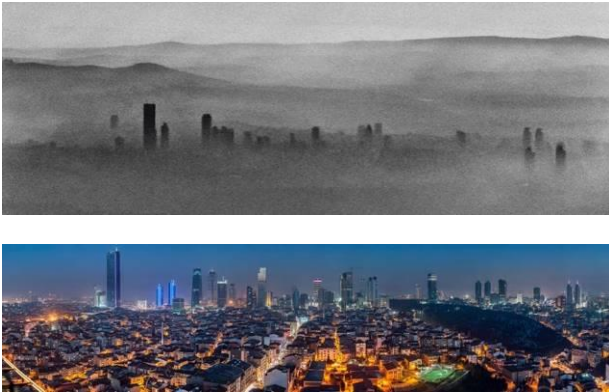
Figure 1& 2: Istanbul business district from an airplane (up), from a skyscraper (down).

satellites and finally unmanned aerial vehicles (UAVs) / drones are among the vehicles, tools and places to create aerial photos with / from. The substitute solution, is to carefully select the proper seat in national and international flights, taking advantage of online check-in feature. I first check the possible course that the plane follows in normal conditions, checking the previous day's flight route information from flightradar24.com and choose left or right window seats accordingly, always away from the wings so that I have a clear view angle with no obstructions.