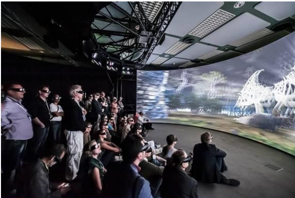
Figure 3: Mobile TimeLab, An Immersive Viewing Area, HD Panorama.

transmitting, and the feedback of the audience and other users, leads to new research questions. This might also influence the design of new technological developments – from the already introduced 360-degree panoramic recording (with the OmniCam-360 of the Fraunhofer Institute HHI) and 3D Audio and 3D Video to immersive media (see Figure 3) – revolutionizing the way we experience and appreciate cultural events like concerts, theatre and exhibitions.