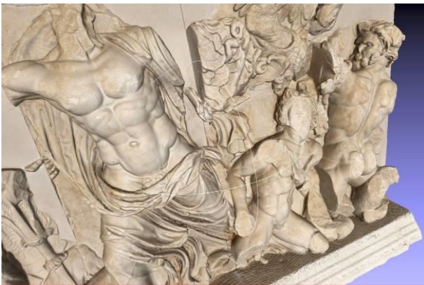
Figure 2: Screenshot from a 3D Model by Fraunhofer IGD. (The scanning has been supported by the German Federal Government, BKM) © Antikensammlung, Staatliche Museen zu Berlin, Pergamonaltar, 3D Model, Detail, 2016.

Apart from ‘curating digital data’ attention of Berlin Cultural is currently focused on ‘digital curating’. Recent technological advances show a profound impact towards the way in which we curate, exhibit, perform or broadcast our art: e.g. ultra-high-resolution panorama techniques of the Berlin based Heinrich-Hertz Institute [13], high-precision optical sensor systems of the German Aerospace Center – Institute of Optical Sensor Systems [14] or new tools for 3D mass digitization in the cultural heritage domain of Fraunhofer IGD (see Figure 1) [15]. There is no speculation in assuming that these technological achievements shall inevitably pose the question how to use and how to play the circuit of hybrid screens, virtual exhibitions and streamed concerts in the future time. Thus, the major challenge of Berlin Cultural is certainly to strengthen technical, legal and curatorial co-operation with Berlin Digital. Augmented reality and mixed reality applications are already on the horizon with the UHD live streaming from the Berlin Philharmonic Orchestra [16] or the High-Res 3D modelling of the Pergamon Altar (see Figure 2) [17].