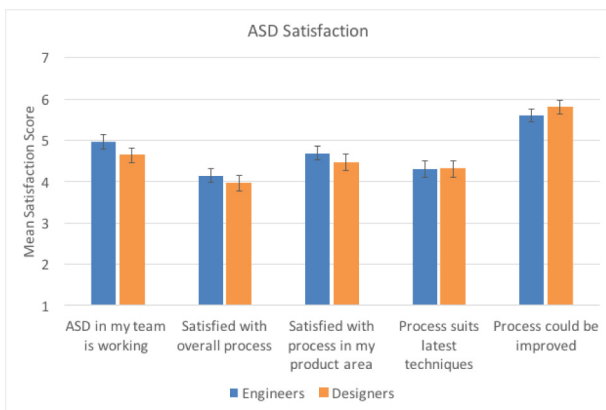
Figure 1: Percentage of participants in both groups responding "agree" or "strongly agree" to questions of satisfaction with ASD (see text for details).

Thus, the two groups did not differ in their perception to what degree ASD is already applied in the development process, both on team level and in the organization as a whole, and with what success (see Figure 1). Both roles thought that there was significant scope for improvements of the ASD process.