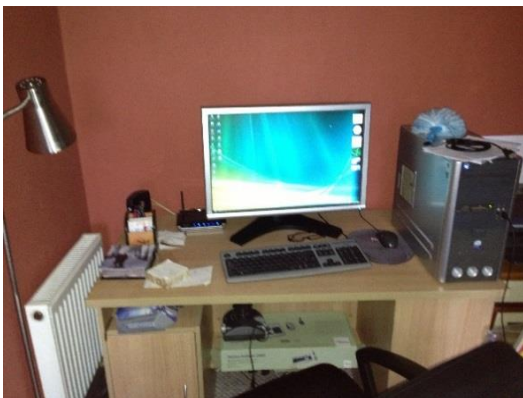
Figure 3: “C”’s PC setup

“C” admitted to having widespread knowledge of digital technologies and described himself as a “gamer”. He was able and quite comfortable with a wide variety of digital skills, including being able to build his own machine, network all his appliances and to fix/install computer components, for instance changing a graphic card or other elements of the motherboard in his machine.