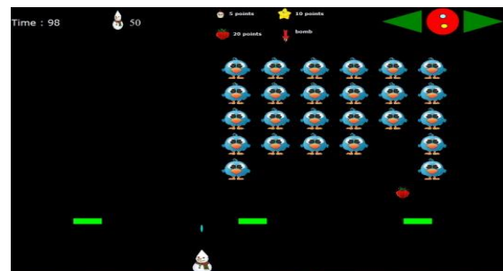
Figure1. 'Space Invaders' Game

A different style of interaction map was required for the tangible input methods as it relied on a tilting movement rather than button presses. The visualization, shown in Figure 2, not only made the actions of other players visible but also assisted users in understanding the degree of physical tilt of the controller required to generate the left/right movement inputs.