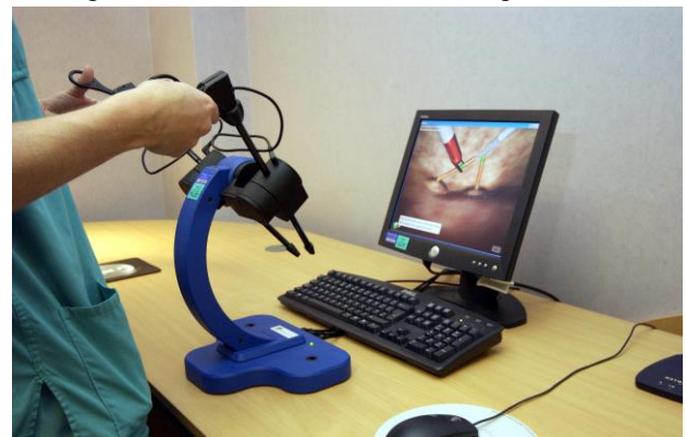
Figure 2: Digital simulation for laparoscopic surgery

At first glance, supervised learning appears to represent a promising solution here: the data that informs clinical decision-making is readily expressed as a feature vector, and mapping this to the corresponding clinical actions can be reframed as a multinomial classification problem. So where we are struggling to capture the complexity of the relevant medical knowledge base in a generalizable ruleset using conventional computing strategies, a suitable classification algorithm could