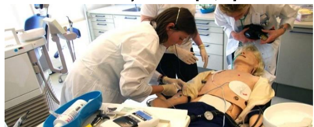
Figure 1: High-fidelity, face-to-face clinical simulation

There are a range of novel technology-based solutions on the market but their efficacy remains unproven [8]; high-quality simulation training for clinical staff is still by far the best-evidenced intervention [9,10]. However, the resource-intensive nature of existing, face-to-face simulation methods is a limiting factor in arranging high frequency resuscitation training, due largely to the requirement for a high ratio of expert instructors to trainees. There is evidence to suggest that the optimal training frequency might be as often as six-weekly [11], but, in ever-shorter-staffed healthcare systems, even the logistic challenge of ensuring practitioners have access to an Advanced Life Support (ALS) course just once every four years has necessitated a push by the European Resuscitation Council to streamline training and cut courses from two days to one [12,13]. It is to this